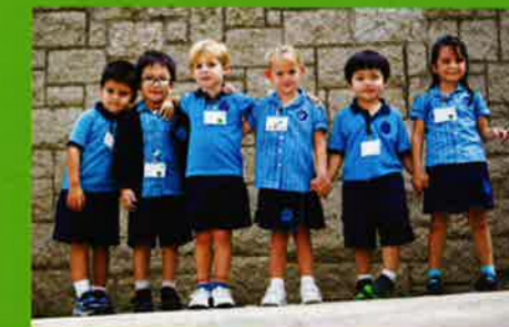
Pupils outside International Kindergarten, Tung Chung.