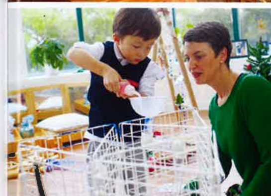
EtonHouse Tai Tam.

interaction with the children and asking pertinent, thought-provoking questions. Children then have opportunities to find the information for themselves.