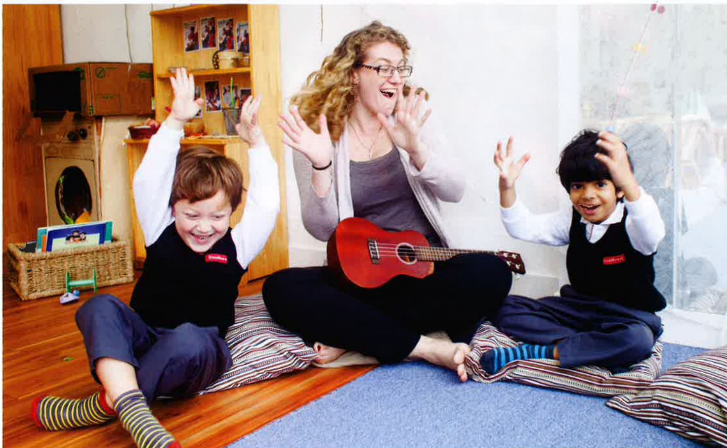
EtonHouse students enjoy music time.